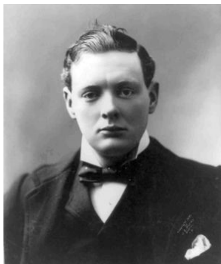
A young Winston Churchill in 1890