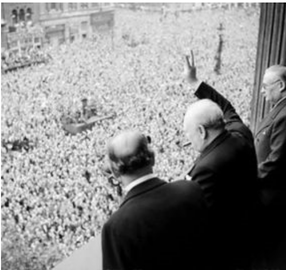
Churchill waving to the crowds on V.E. Day