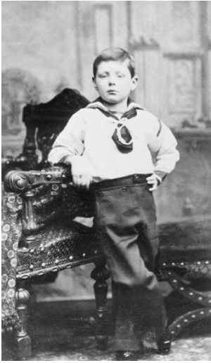
Churchill aged 7 in 1881