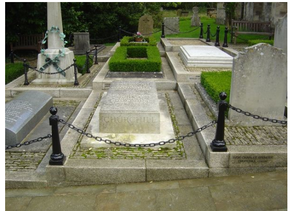
Churchill's grave at St Martin's Church, Bladon