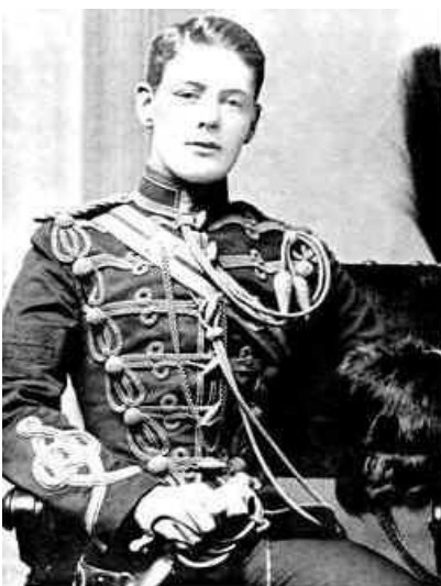
Churchill in military uniform in 1895