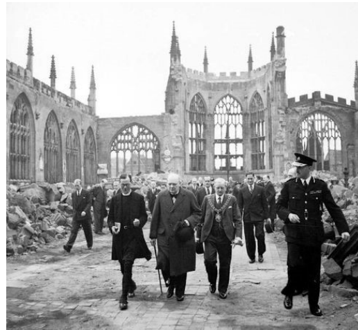
Winston Churchill walks through the ruins of Coventry Cathedral, 1941