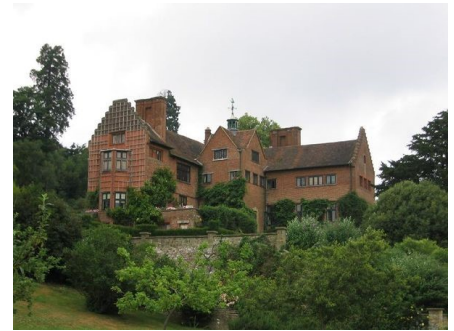
Churchill spent much of his retirement at his home Chartwell in Kent. He purchased it in 1922 after his daughter Mary was born.