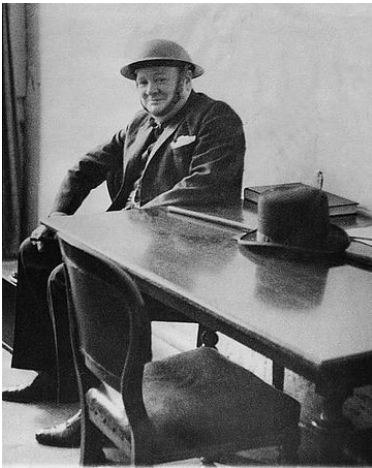
Churchill wears a helmet during an air raid warning in the Battle of Britain in 1940