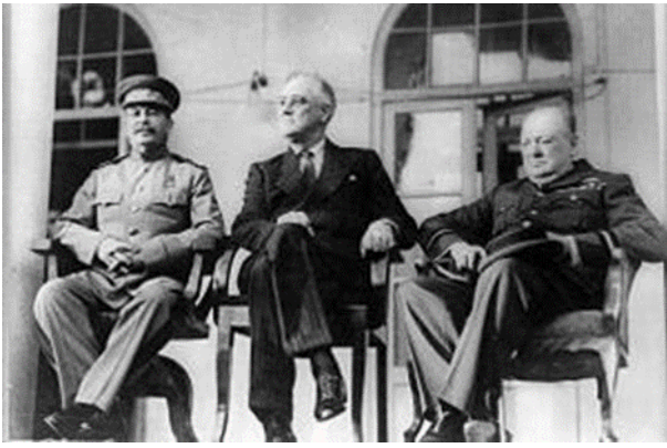
Churchill with President Roosevelt and Joseph Stalin