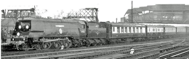
Sir Winston Churchill's funeral train passing Clapham Junction