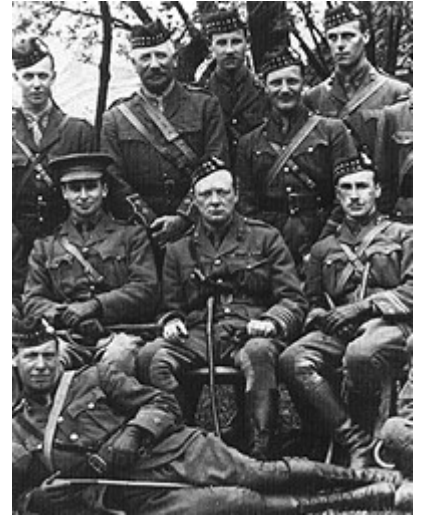
Winston Churchill commanding the 6th Battalion, the Royal Scots Fusiliers, 1916.